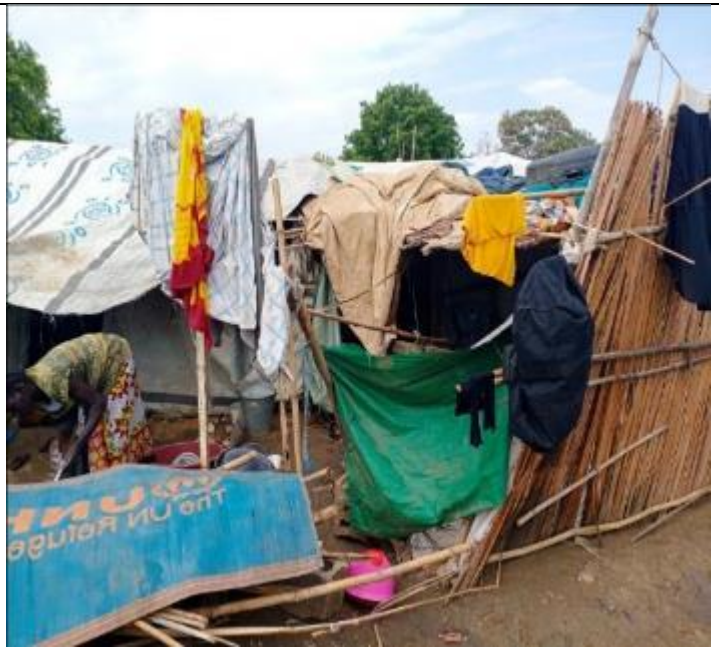
Wall of Shelter covered with bed sheets and local mats