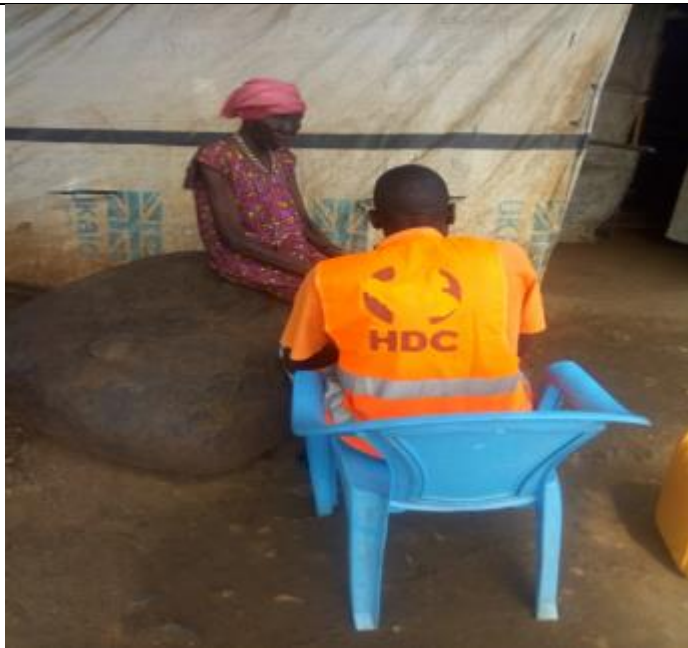
HDC Enumerators during Shelter assessment