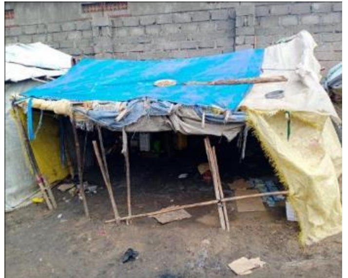
An IDP left his shelter because it is damaged.