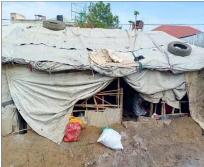
Damaged roofs and walls in MAHAD IDP site